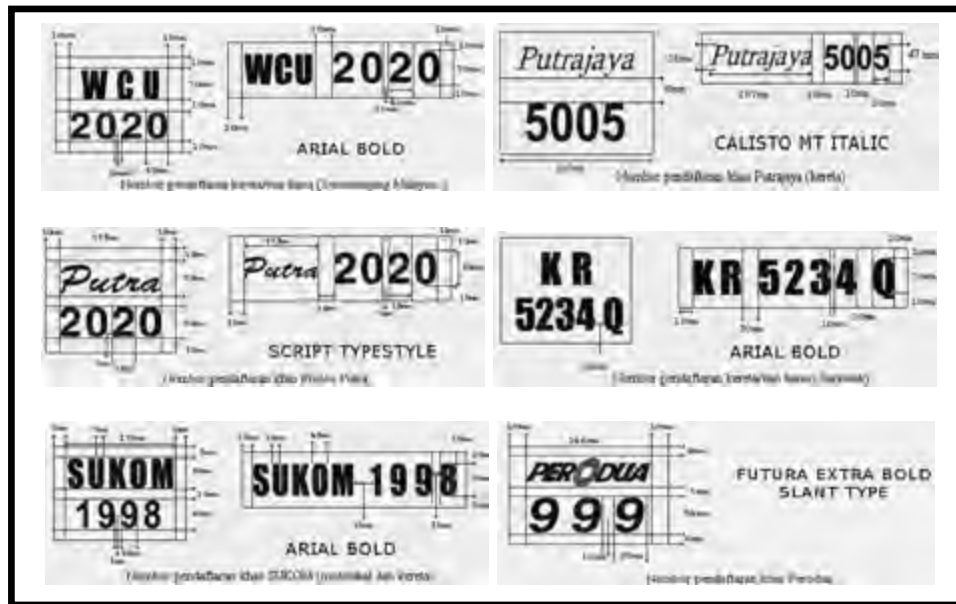
Figure 2.1: Standard size for plate number set by JPJ