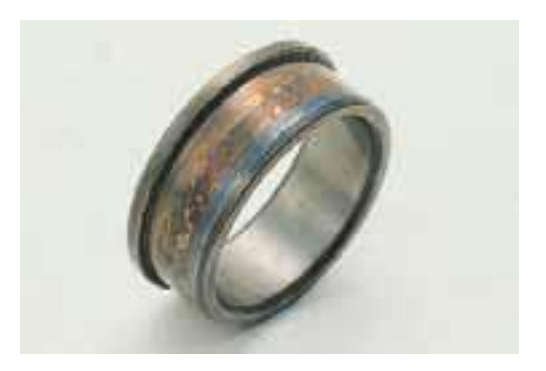
Figure 2.8 Roughening [17]

Preventive measures to avoid a recurrence of roughening include improved lubrication, improved sealing, and cleaning of the shaft and housing prior to mounting.[17]