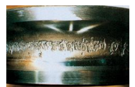
Figure 2.1 Bearing Flaking [10]

In order to avoid a recurrence of flaking, preventive measure that can be taken into consideration may include using a bearing with a higher load rating, reducing an abnormal load, and possibly increasing lubricant viscosity.[10]