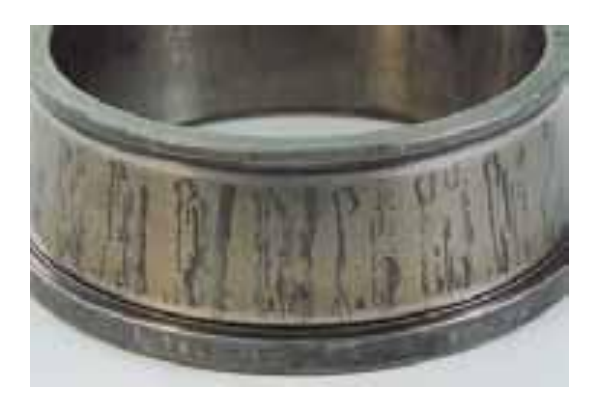
Figure 2.5 Rust Failure [14]

Preventive measures to avoid a recurrence of rust include storing in a dry location, avoiding direct hand contact while mounting, and not allowing water to condense on or flood the bearing. The rust failure of bearing is illustrated in Figure 2.5.[14]