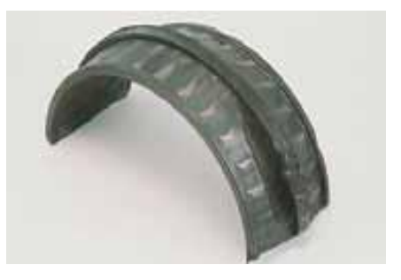
Figure 2.2 Seizing Failure [11]