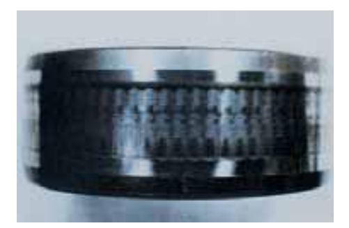
Figure 2.7 Electrical Erosion[16]

In order to avoid a recurrence of electrical erosion, the current source should be eliminated, the bearing should be insulated, and alternate grounding path should be provided. Particular attention must be paid to grounding paths during welding, to avoid passing welding currents through bearings.[16]