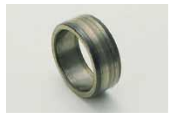
Figure 2.6 Wear Failures [15]

Preventive measures to avoid a recurrence of wear include improved lubrication and improved sealing. [15]