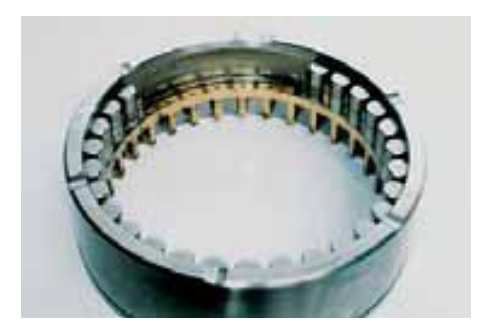
Figure 2.4 Retainer Failures [13]

Preventive measures to avoid a recurrence of retainer failure include eliminating the means of entry for foreign matter getting into the bearing and care during mounting.[13]