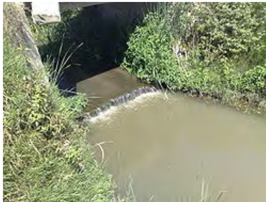
Figure 2.2.3: Deep collector drain ( http://www.encyclopedia.com/doc/1O999-measure.html ).

The main drainage systems consist of deep or shallow collectors, and main drains or disposal drains. Deep collector drains are required for subsurface field drainage systems, whereas shallow collector drains are used for surface field drainage systems, but they can also be used for pumped subsurface systems. The deep collectors may consist of open ditches or buried pipe lines. The terms deep collectors and shallow collectors refer rather to the depth of the water level in the collector below the soil surface than to the depth of the bottom of the collector. The bottom depth is determined both by the depth of the water level and by the required discharge capacity. The deep collectors may either discharge their water into deep main drains (which are drains that do not receive water directly from field drains, but only from collectors), or their water may be pumped into a disposal drain. Disposal drains are main drains in which the depth of the water level below the soil surface is not bound to a minimum, and the water level may even be above the soil surface, provided that embankments are made to prevent inundation. Disposal drains can serve both subsurface and surface field drainage systems.