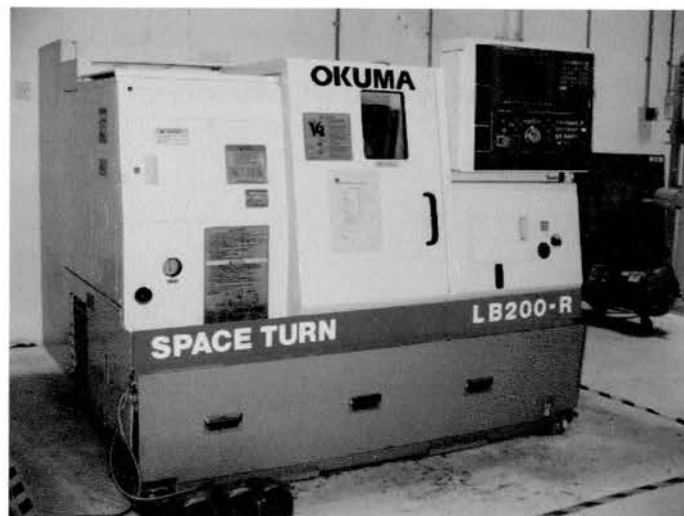
Figure 2.22: CNC lathe machine

The design of a CNC lathe has evolved yet again however the basic principles and parts are still recognizable, the turret holds the tools and indexes them as needed. The machines are totally enclosed, due in large part to Occupational health and safety (OH&S) issues.