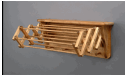
Figure 2.1.1: Wall Mounted Expandable Clothes Drying Rack