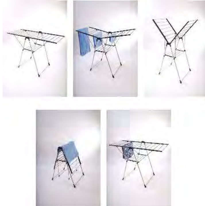
Figure 2.1.2: Butterfly Clothes Drying Rack