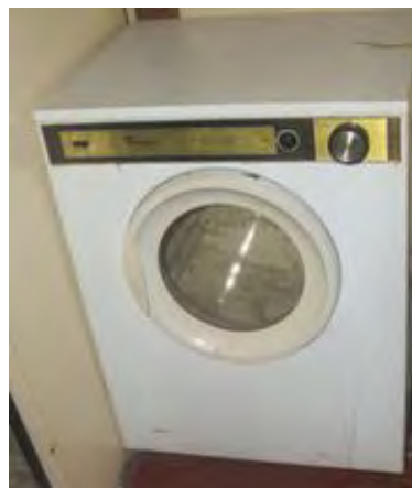
Figure 1.2: Clothes dryer

In this modern century, rich people uses clothes dryer. A clothes dryer or tumble dryer is a household appliance that is used to remove the moisture from a load of clothing and other textiles, generally shortly after they are cleaned in a washing machine ( http://en.wikipedia.org/wiki/Clothes_dryer ).