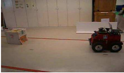
Figure 2.1 HANS Vehicle [1]

HANS in [1] uses a low resolution web camera located in the centre of the vehicle behind the rear-view mirror and a set of sixteen sonar sensor. The key role of the camera is to act as a vision system. It is used to detect the side lines that bound 7 the traffic lanes, the position and orientation of the robot relative to these lines, and the vehicles driving ahead and determining their lane and distance to the robot.