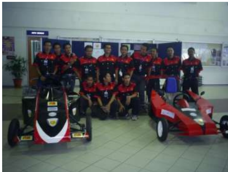
Figure 2.2: Team 2006