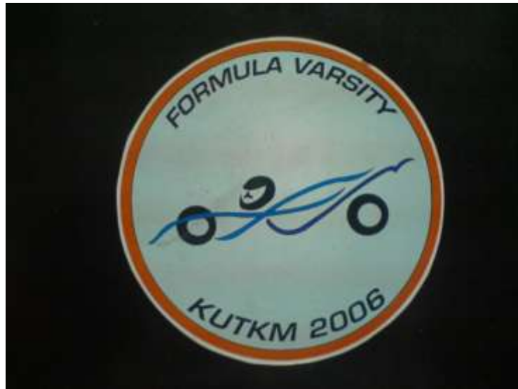
Figure 2.1: Logo of Formula Varsity during 2006

Varsity takes students out of the classroom and allows them to apply textbook theories to real work experiences. ( www.formulavarsity.wordpress.com ). The Figure 2.1 and Figure 2.2 show the photos obtain from UTeM Formula website.