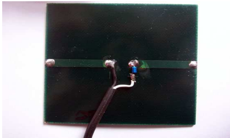
Figure 2.5: Solar Blocking Diode

Another function is to block the reverse flow down damaged modules from parallel modules during the day. Blocking diodes placed at the head of separate series wired strings in high voltage systems can perform yet another function during daylight conditions. If one string becomes severely shaded, or if there is a short circuit in one of the modules, the blocking diode prevents the other strings from losing current backwards down the shaded or damaged string. The shaded or damaged string is “isolated” from the others, and more current is sent on to the load. In this configuration, the blocking diodes are sometimes called “isolation diodes”. (Anon, 2003)