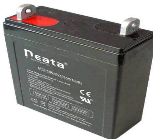
Figure 2.4: Solar Storage Battery

Another important thing to be considered is about the process when discharge the batteries. There is one method named Depth of Discharge (DOD). This method is related with the voltage drop before the next charge cycle. Most battery ratings talk about 50% or so, but they will last longer if you keep them as charged as possible. For lead acid batteries is like to be fully charged. They will last much longer if not discharge it too deeply. This is known as shallow cycling and greatly extends their life. However, they can withstand discharges down to 20%.