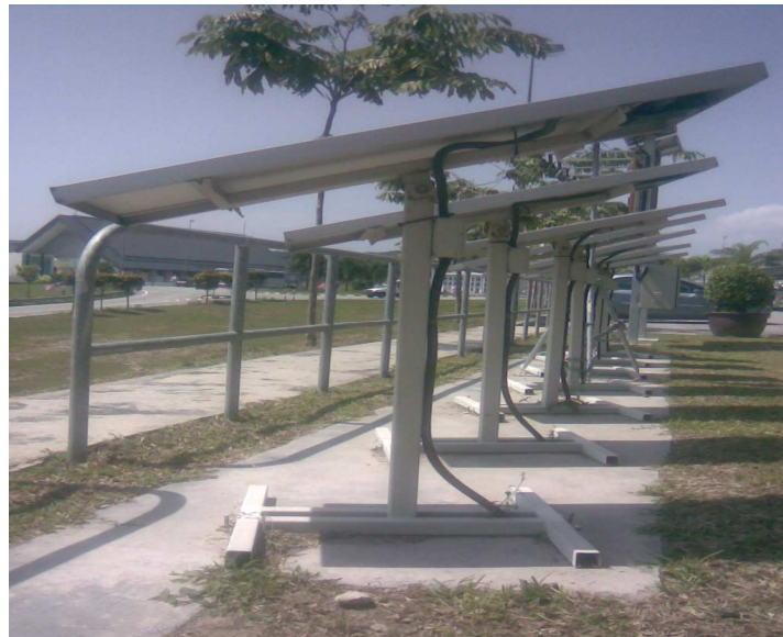
Figure 2.2: Solar panel at FKE