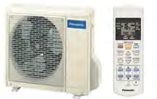
Figure 1.0(2b): non inverter compressor

Most consumers tough to select or determine the suitability of any type of air conditioner they should buy. Thus, to solve this problem, a study is conducted to determine the suitability of these two types of air conditioners.