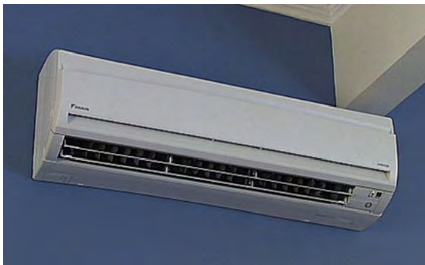
Figure 1.0(2a): non inverter air- conditioning split unit

Non-inverter air-conditioners is a conventional air conditioner (normal air air conditioning). It is cheaper than the inverter. Non-inverter type air conditioner uses more power than the inverter to turn the compressor. Power to turn the compressor is a constant temperature of the cooling process. Cost per unit for non-inverter type air conditioners are less expensive and the cost to repair is more expensive than an inverter type air conditioner. Figure 1.0 (2a) show below is the non-inverter air-conditioner model CS-S12MKH, the different of inverter and non-inverter is the non inverter not have new technology in the system and the current run maintain to get the thermal comfort in the space The design of inverter air-conditioning are old pattern and if see the housing of this air-conditioner not have label” inverter”. The compressor of non-inverter model CU-C12MKH is very noise show in figure 1.0 (2b).To identify the types of non-inverter compressor is not attached to any variation in outdoor air-conditioning. Compressor runs in standard condition without control speed.