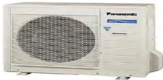
Figure 1.0(1b): Inverter compressor (Source from web site Panasonic 1.5hp inverter)