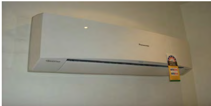
Figure 1.0(1a): Inverter air- conditioning split unit (Source: Panasonic brochure 2010)

non-inverter and the cost of maintenance is also expensive (www.wikipedia.com). Figure 1.0 (1a) show below is the inverter air-conditioner indoor split unit model CS-S13MKH. This air-conditioner uses a new technology intelligent inverter in the system. Inverter has an eco sensor and petrol sensor to detect the cooling load and dirt in the room and can mild dry cooling. Figure 1.0 (1b) is the inverter compressor model CU-S13MKH (outdoor). Inverter compressor is very quite mode to run the compressor. Inverter compressor has been converting to use an electronic device that installed in the outdoor air-conditioning in order to control the speed of the compressor .The compressor inverter can make the room in home quick comfort.(Source from Panasonic brochure 2010)