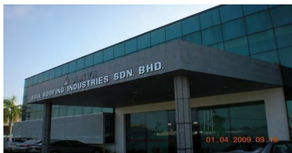
Figure 1.1: Main Building for Asia Roofing Industries Sdn. Bhd

Asia Roofing Industries Sdn bhd was formed in 1990 as a manufacturer of top qualities long length tiles, industrial roofing and wall cladding under the brand name of —AJIYAL.