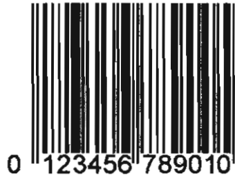
Figure 2.1: Example of Barcode.

computer uses to look up an associated record that contains descriptive data and other important information.