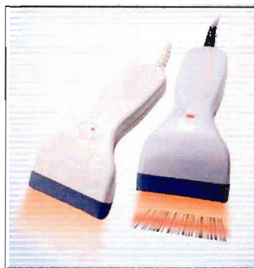
Figure 2.3: Barcode Scanner.

A barcode reader contains two parts. The first part is the scanner that scans the image and converts into digital representation (01111000). The second part is the decoder which combines the binary digital signals into a series of characters. The decoded information is sent to the computer via keyboard or serial interface.