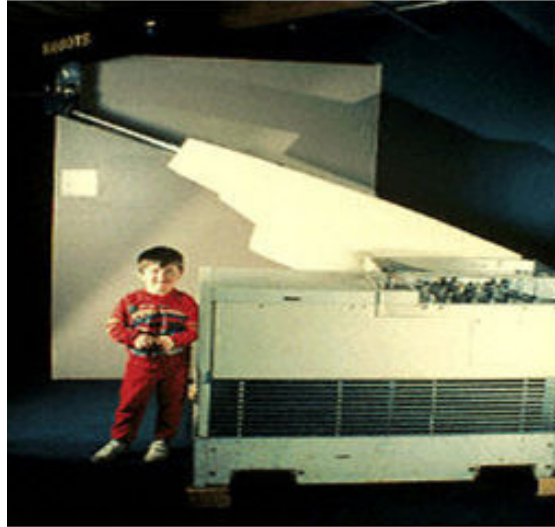
Figure 1.2.1: UNIMATE robotic arm (Anonymous 1961)