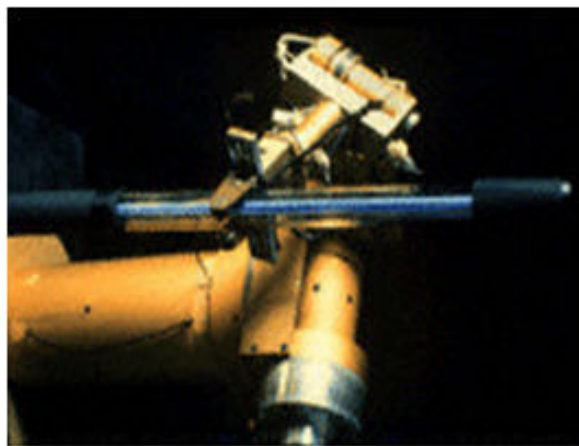
Figure 1.2.2: Rancho Arm (Anonymous 1963)