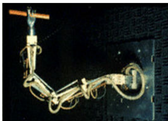
Figure 1.2.3: Tentacle Arm (Anonymous 1968)