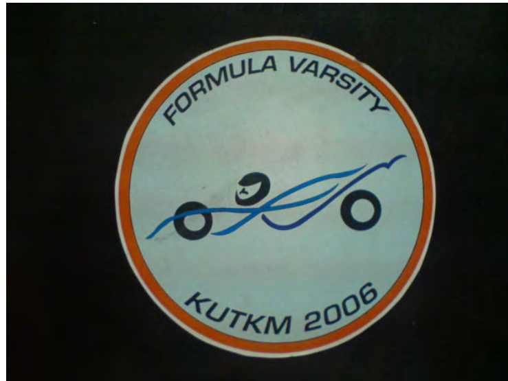
Figure 2.1: Logo of Formula Varsity during 2006

Varsity takes students out of the classroom and allows them to apply textbook theories to real work experiences. ( www.formulavarsity.wordpress.com ). The Figure 2.1 and Figure 2.2 show the photos obtain from UTeM Formula website.