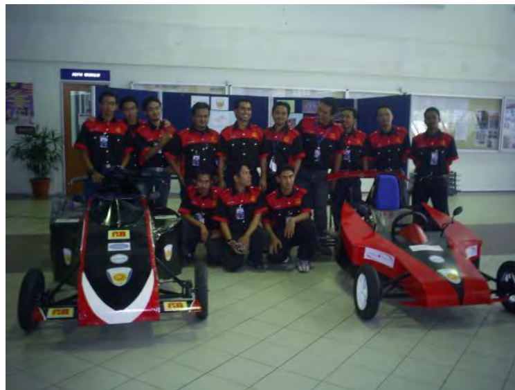
Figure 2.2: Team 2006