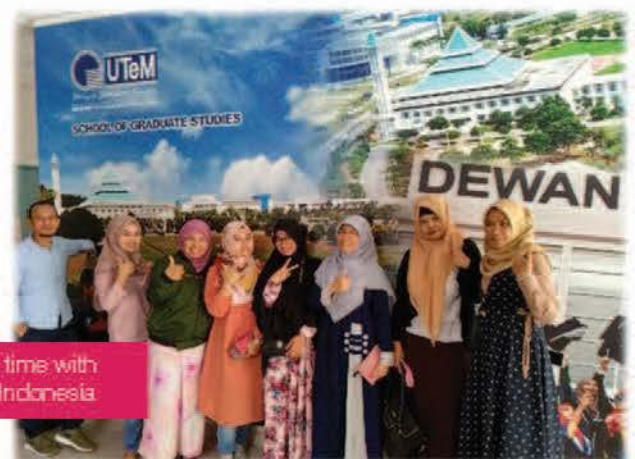
Picture session during the break time with several friends from Indonesia

I feel that 2 days in workshop activity, we get a lot of PhD knowledge, how about for 2 years? I cant imagine how much can I get here, from UTeM. Hopefully, I can successfully bring PhD title from UTeM with proudly.