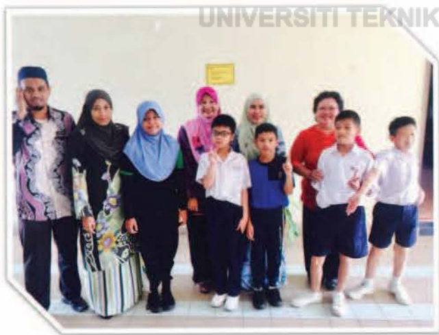
A day with Autism Children.

I embarked on the journey of my PhD on September 2016 under "Hadiah Latihan Persekutuan" scholarship. I am grateful for this precious opportunity after 3 years of graduating Master from UTeM. Yet, the journey throughout a PhD is hardly perpetually a logical and constrict roadway. And between the contort and pivot and backtracking you will be contrived to grasp, you can certainly overlook vision of your objectives and ground for beginning out on the journey. During the early days, I explored several potential topics where I would later choose one, which best suit my interest and has the potential to be developed into a PhD thesis. I decided to study the effect of virtual reality technology in learning mathematics, focusing on problem solving learning among autism children.