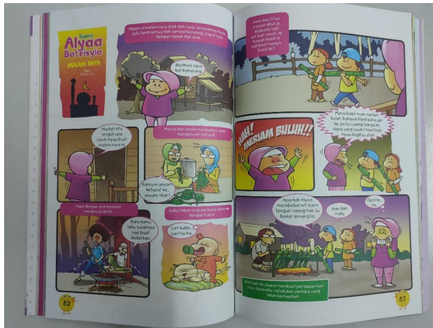
Figure 2.1: Super Alyaa Batrisyia Malam Raya from Ana Muslim Comic

Another existing system that is related to this project is the comic strip. The comic strip on a blog site with the title “What We Love About Ramadan”. The comic strip was made by Ernest Ng on http://dontlikethatbro.blogspot.com/2013/07/what-we-love-about-ramadan.html . The comic is just a simple comic strip on what the author likes during Ramadan. Drawn with a traditional comic format with similar layout which is regular 2x3 borderline panel. There are 2 types of speech balloons included in the comic. The first one is rounded balloon with tail which is intended to show that the character is speaking clearly to be heard by other characters. The second balloon used is serrated contour balloon, which is use to express character’s emotion like angry or excited while screaming. The comic is not a storyline comic, which the author includes total of 6 different situations in a layout consist of 6 panels.