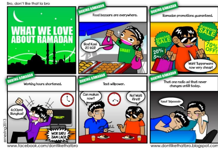
Figure 2.2: What We Love About Ramadan Comic Strip http://dontlikethatbro.blogspot.com/2013/07/what-we-love-about-ramadan.html

The third existing system similar with this project is from The Muslim Show that is published on Facebook. It not only focusing on Ramadan but entirely theme about da'wah. The comics from The Muslim Show uses semiotic symbols. The semiotics symbols used in the comics is to study the meaning behind the created symbol (Azizi, 2021). The characters in the comic are drawn in the form of silhouette. All the comics come with various layout, and some even have only 1 panel layout. The speech balloons is drawn differently in each comic which some in the panel and some are outside panel. Most of the speech balloons used is rounded balloon with tail to show that the character is speaking and is intended to be heard by the other characters in the comic.