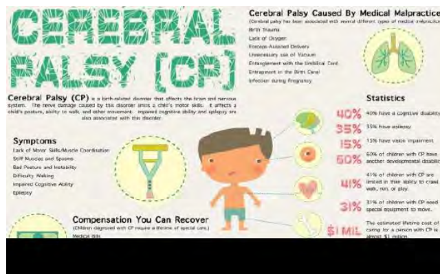
Figure 2.1: Definition of Cerebral Palsy (CP)