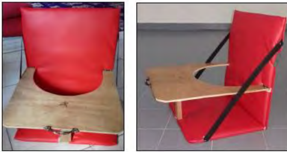
Figure 2.2: The design of previous corner chair from previous student

Based on the previous corner chair project by the previous student, the design is just suitable for mild CP kids which aged below than 2 years old. This project was actually being done with the collaboration with Rehabilitation Unit at Hospital Melaka. This design is not suitable for kids aged 3 years old and above. Plus, the design of the corner chair is a bit square in dimension which not fully solved the problem of CP kids. In order to improve kids minimal care from adults, the design of the corner chair should be improved.