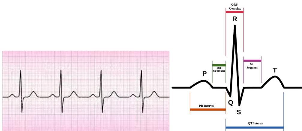
Figure 2.3.2: Example of electrocardiogram (ECG)

skin that arise from the heart muscle's electro physiologic pattern of depolarizing and repolarizing during each heartbeat. The ECG is divided into 3 sections, a P wave, a QRS wave and a T wave, which represent depolarization of the atrium, depolarization of the ventricles and repolarization of the ventricles respectively. By referring to the ECG, it can be used to calculate the rate and rhythm of heartbeats, , the presence of any damage to the heart's muscle cells or conduction system, the size and position of the heart chambers, the effects of cardiac drugs, and so on [7].