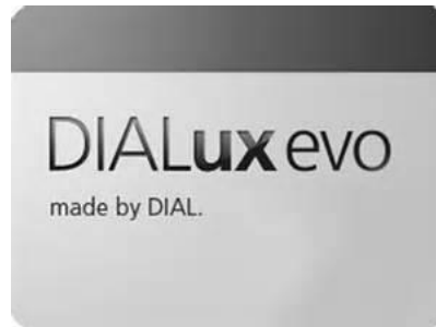
Figure 2.1: DIALux Logo

As a free software, DIALux is widely used by designers, architects and even engineers in order to plan the interior and outdoor lighting of a building to achieve different desires and designs that satisfy the client's expectations. The highlight of this software is the ability to visualize, estimate and calculate the amount of natural light (sunlight). Other than that, DIALux software is able to plan lighting vision, design the color and intensity of lights which are going to be applied. Not forgetting, it may also arrange the position of emergency lighting with the acceptable level of luminaires and many more potentials.