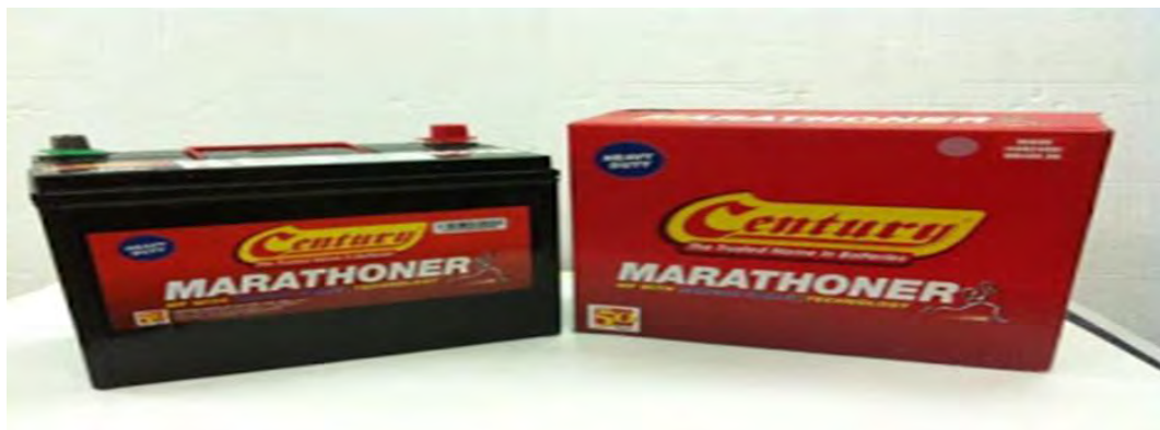
Figure 3 Lithium Ion