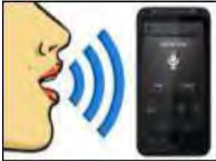
Figure 2.1 Voice act as input towards phone

As illustrated in figure 2.1, there are voices that act as input towards the telephone receiver. Voice or speech recognition is the ability of a machine or program to accept and interpret the dictation, or to comprehend and execute uttered commandments which is cited by (O'Shaughnessy, 2001)