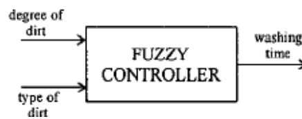
Figure 2.2: Fuzzy Controller Block Diagram

An optical sensor is constituted of the light emitting element (LED diode) and the light receiving element (phototransistor) placed opposite each other. When the output LED diode light intensity is constant, phototransistor emitter voltage shows water transparency. Led diode intensity is controlled by the pulse width of transistor base PWM signal, from the microcontroller. The voltage on sensor emitter resistor is sensor output voltage and connected to microcontroller A/D converter. In that case, the temperature measuring is done by the temperature sensor, which is included in the optical sensor construction above (see figure 2.3).