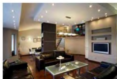
Figure 1.2: Example of home lighting system

Figure 1.2 above shows the example of home lighting system. Based on observation, there are many positive feedbacks that given by the customers who are using