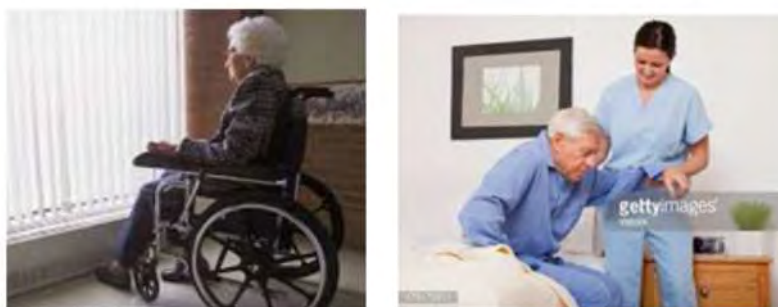
Figure 1.3: Handicapped person and elder aged people

The main motivation to develop this project is to facilitate handicapped person, elder age people and also patient who has a difficulties in their daily life compared to other healthy people. For example, person who sits on wheelchair can't press the device's switch manually. If we are not going to propose the solution for them, they maybe will let the waste of electrical energy while waiting for other people to come and help them. Other than that, it also can help disable users to access the home device's switch physically from far area.