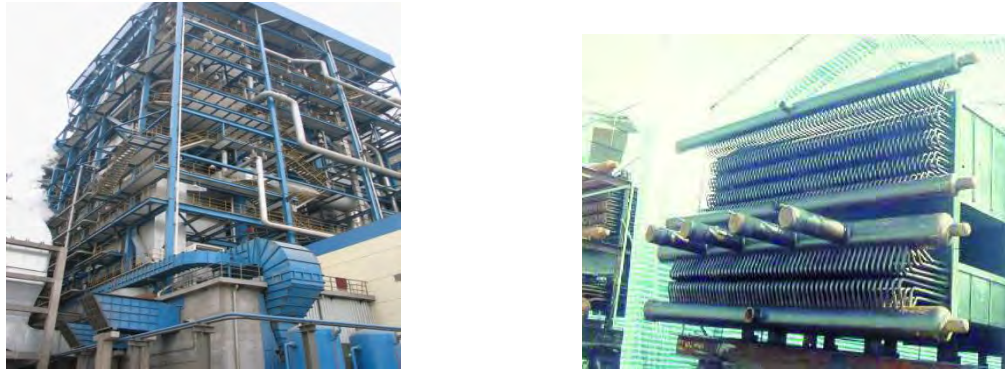
Figure 2.1-1 Example of Boiler in industries

According to (Rayaprolu, 2009) boiler is a device that boils water to produce steam. On scientific perspectives, a boiler changes the chemical energy in fuel into the heat energy in steam. In other words, heat energy of hot gases change in heat energy of steam where no firing is involved. Some of the earliest application can be found in boiling water in a kettle. It is also known as steam generators which have been around for more than 150 years. It can be classified as first classification in which the cases have three types. The first one is Fire tube boilers which flues gases flow through the inside and outside of the tube. Next is the water tube boiler which we will be investigating. Water will flow inside the tube and flue gases flow outside. For the third one, combination (combo boiler) where flue gas and water flow both outside and inside the tube of the boiler. Figure 2.1-1 shows some example of boiler used in the industry.