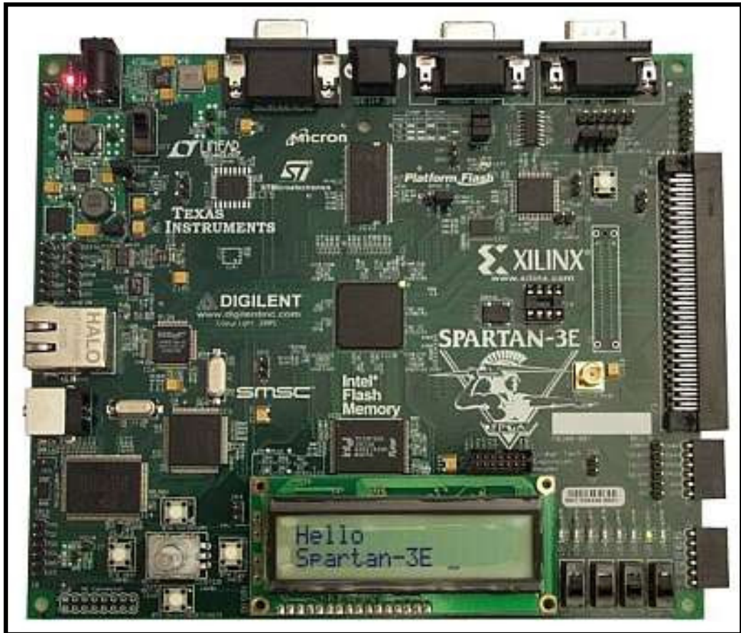
Figure 2- 2 MicroBlaze FPGA Board

This soft core processor in Figure 2-2 is based on Xilinx FPGA which uses a 32-bit of Harvard architecture soft processor. Advanced architecture like AXI interface, Memory Management Unit (MMU), instruction and data-side cache, configurable pipeline depth and Floating-Point unit (FPU) are supported by this processor.