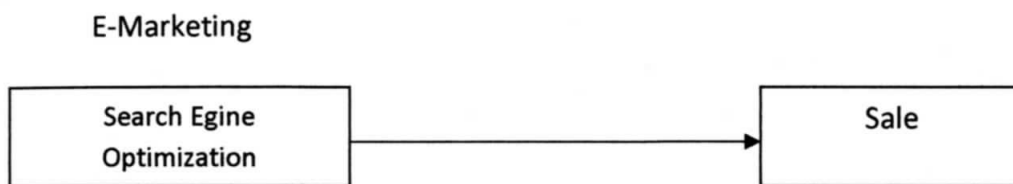
Figure 1: The conceptual framework

This framework is explained about flow of E-Marketing with blog platform using SEO method and not using to get sale.